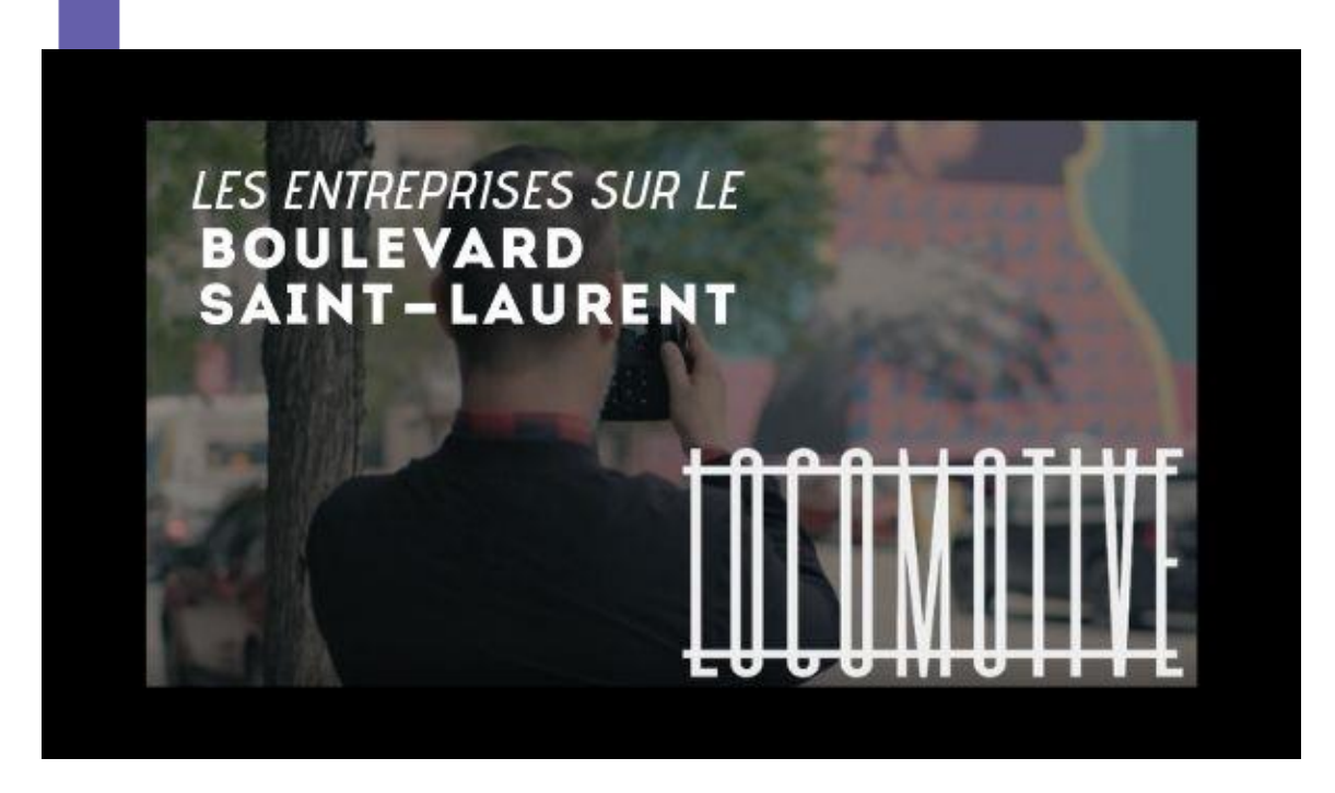
Businesses on the boulevard

Ground floor businesses on Saint-Laurent Boulevard are easily accesible, but what about businesses located on the upper floors? Saint-Laurent Boulevard has recently launched a video project to highlight the success and creativity of these businesses that are an integral part of the Main! In the first video, you'll meet Locomotive, a dynamic and creative web agency! Watch our Facebook page in the coming weeks to discover the other companies of the project!